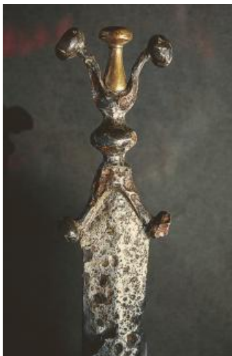
Poignard en fer, Châtenay-sur-Seine (77)

This room also displays remains from the Iron Age. Similarly to bronze, iron making processes developed very gradually.